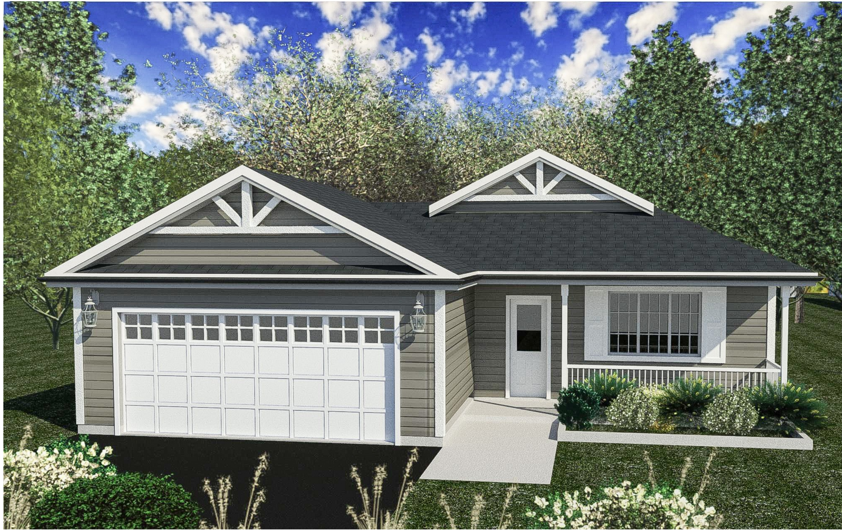
The Severn - Elevation A Artist's Rendering