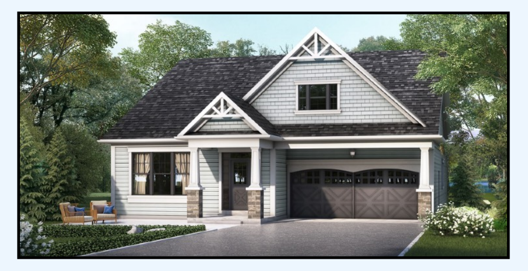
Elevation B - 1,795 square feet (2,506 with loft) (2,479 with extended garage)