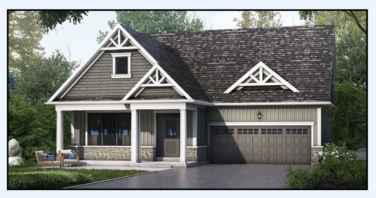
Elevation A - 1,795 square feet (2,506 with loft) (2,479 with extended garage)