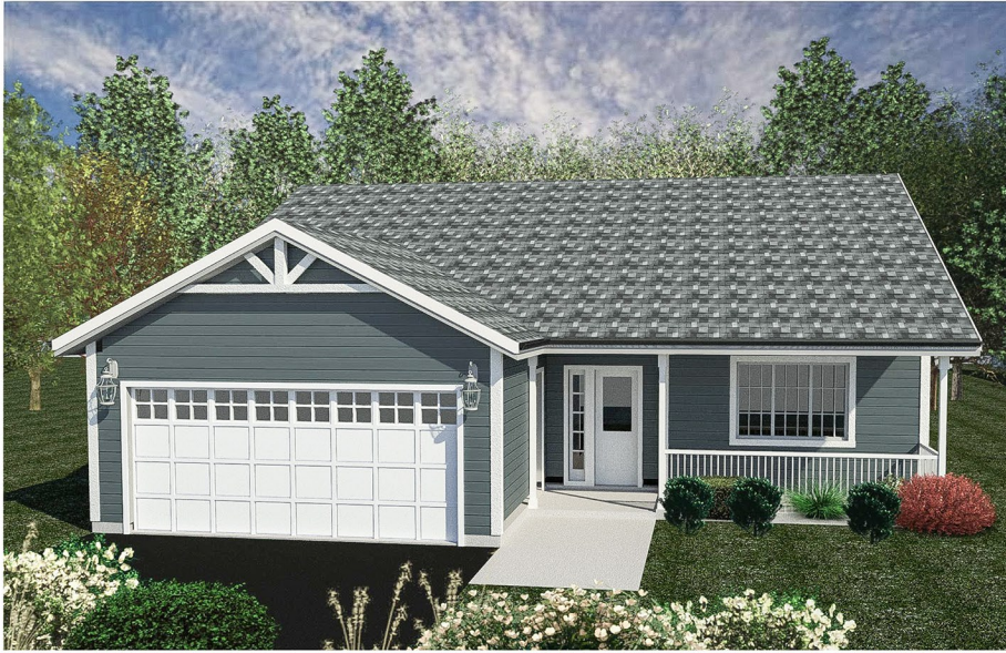
The Balsam - Elevation B