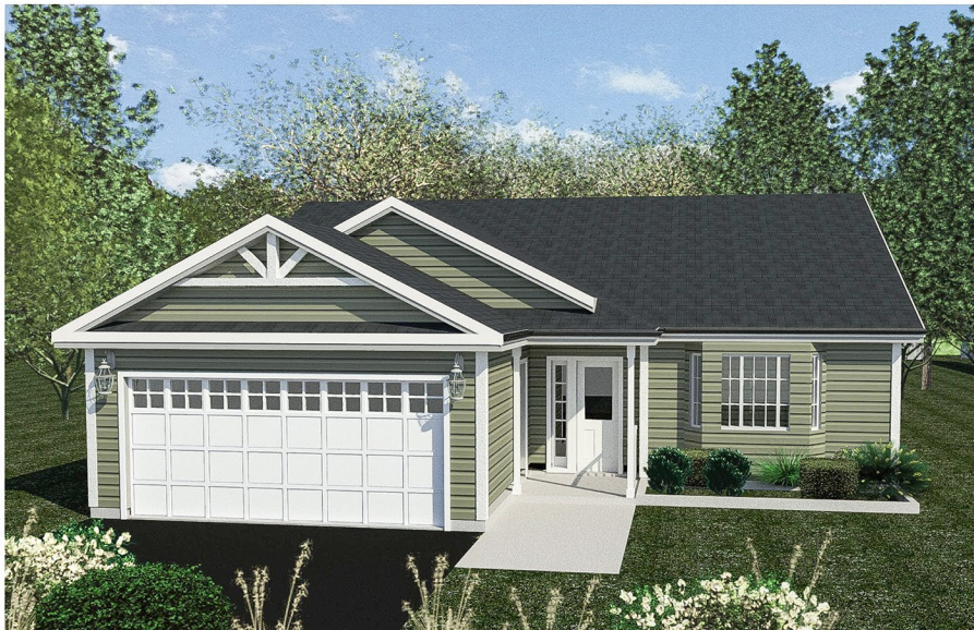
The Balsam - Elevation A