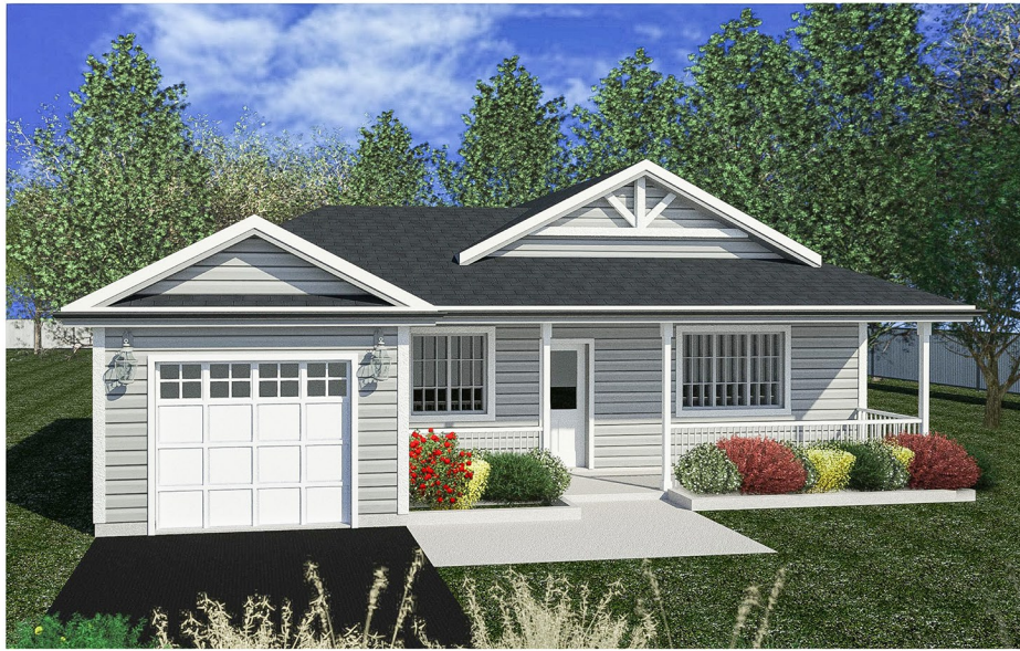
The Georgian - Elevation B