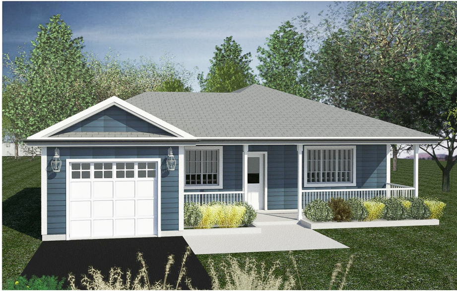
The Georgian - Elevation A