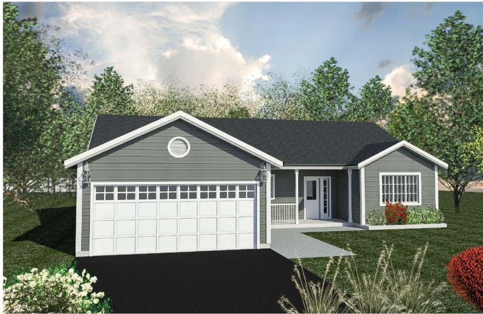
The Trent - Elevation A