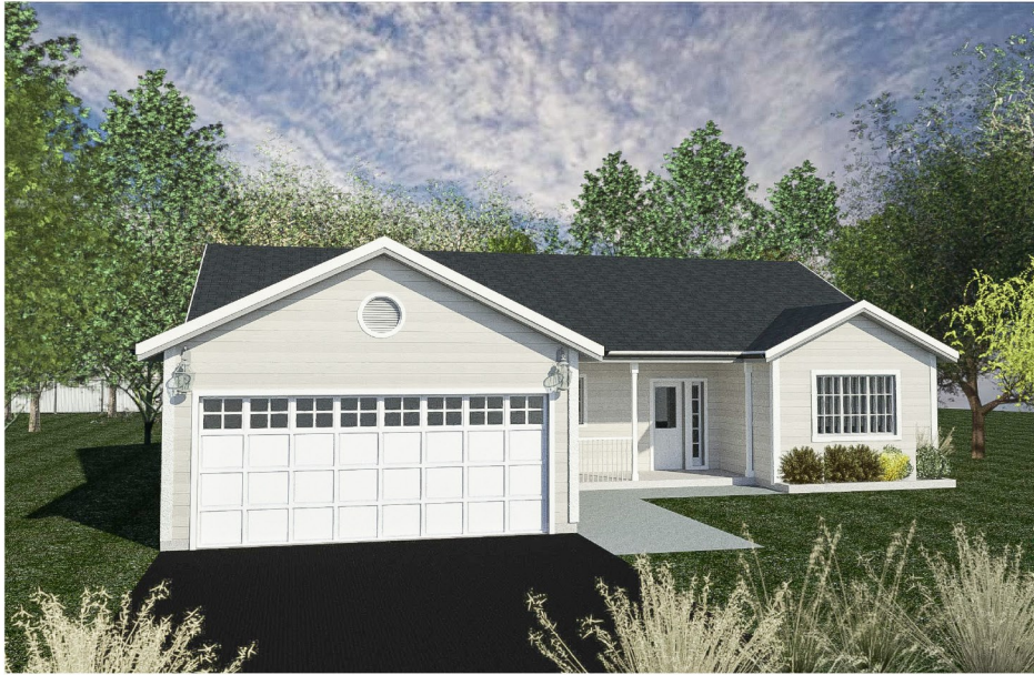
The Trent - Elevation B